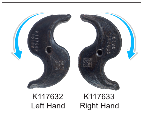
Figure 2 – Left and Right Hand Camshafts