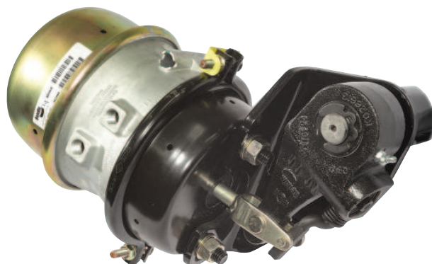
EverSure® Spring Brake with welded clevis

Bendix brand spring brakes and service chambers are brought to you by Bendix Spicer Foundation Brake (BSFB), your single complete source for brake system design, manufacturing, hardware and support for all foundation drum components and actuation systems.