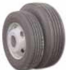
Standard 22.5" vs. low profile 19.5" wheel

Bendix® brand foundation brake products are brought to you by: