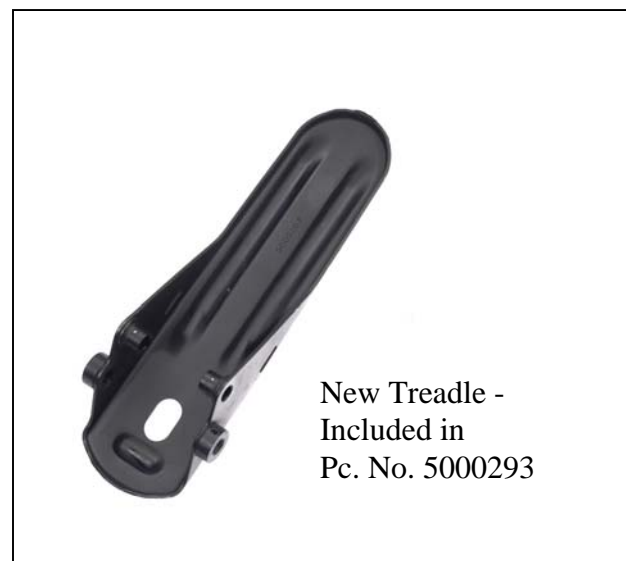
Figure 2 – New Style Treadle