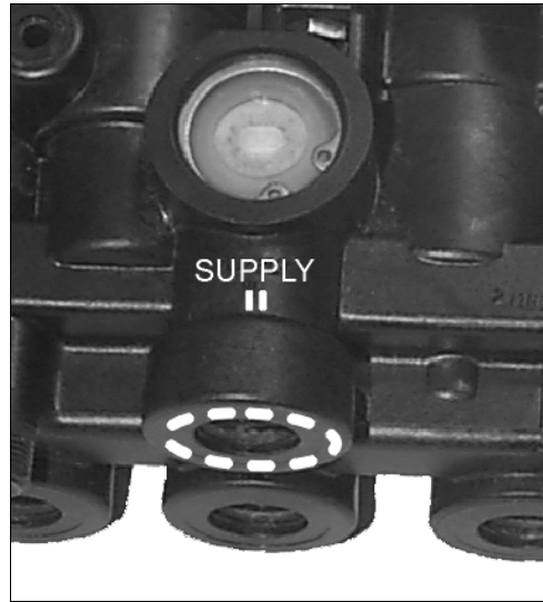
Figure 3: SUPPLY 11 Port Location